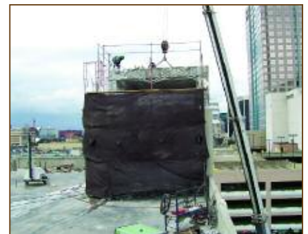
Reconfiguration of elevator shaft-CNL Tower parking garage

plans a third 400,000-sf tower in the next three years.