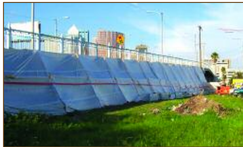
View of existing bridge

Originally named the Lafayette Viaduct Bridge when it was built in 1924 by the Florida Department of Transportation to connect downtown to the waterfront, the present Kennedy Blvd. Bridge was demolished to make way for a modern day gateway to the Channelside District and the Port of