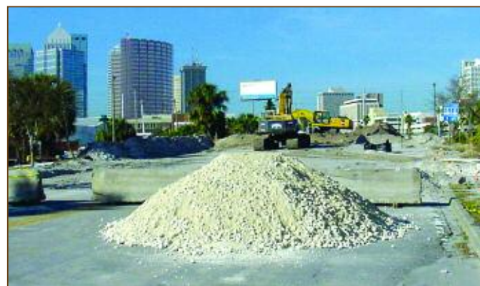
View post-demolition of Kennedy Boulevard bridge

The project is part of the City of Tampa's Meridian Ave. and Crosstown Expressway infrastructure improvements for the new residential and entertainment Channelside District.